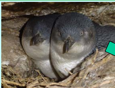
Penguins nest amongst the rocks on the breakwater and use the vegetation that grows there as nesting material

Reproductive success is measured by monitoring penguins in their nests. The number of chicks fledged per pair and the weights of these chicks are recorded over the breeding season, which occurs between approximately June and March at St Kilda.